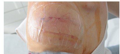
Enables early detection of complications