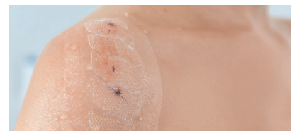
Secure bacteria-proof barrier*