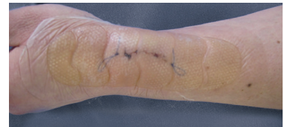
Clear wound visibility**